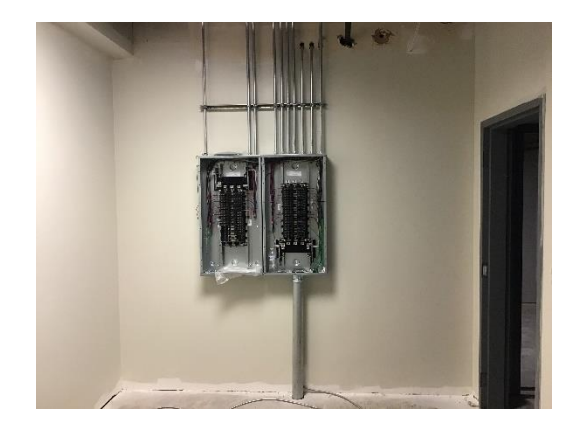
Electrical Panelboard Installed