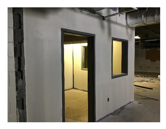
Drywall Prep for Paint at Graphics Lab