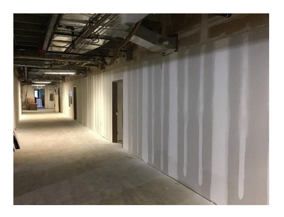
Drywall Prep for Paint at 2<sup>nd</sup> Floor Corridor