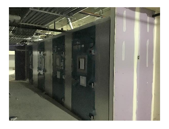
Walk-In Cooler/Freezer Installation