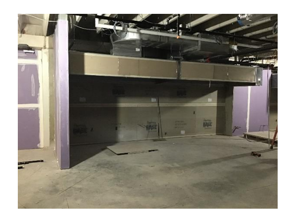
Kitchen Hood Installation at Culinary Arts Lab